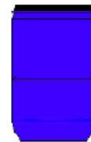
Type 4, Egg Shaped Plastic Drum