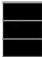
Type 1, Steel