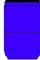
Type 4, Egg Shaped