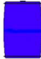
Type 2, L Ring